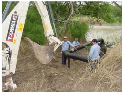
Brownsville Irrigation District and Terex (backhoe)